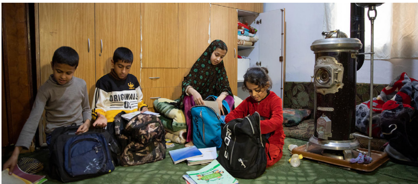
Syrian refugee children studying at home in Jordan.