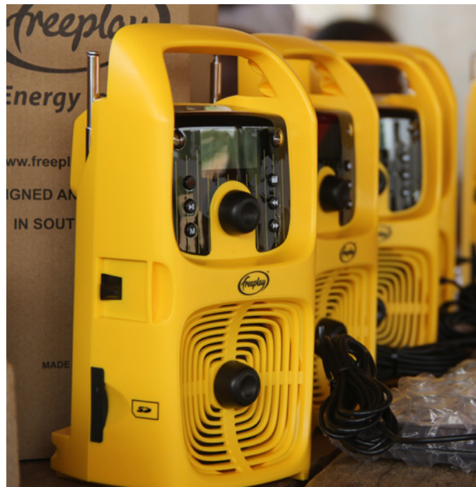
Solar-powered radios can be distributed to households.

Specific policy and resources will be required to support the most vulnerable and marginalised children, across all contexts. In low-resource, fragile or conflict-affected countries, increased flexible investment from donors for the most marginalised children should be prioritised.