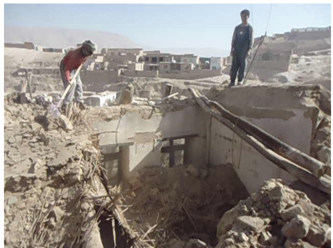
(27 October 2015) Destroyed homes in Qishlaq Bamba area of Pul-e-Khumri city, Baghlan province. Families whose homes were destroyed have taken shelter with relatives.