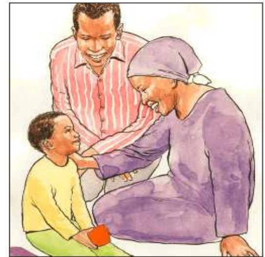
Early Childhood Development Love, play, and communication IMC Ethiopia 2009