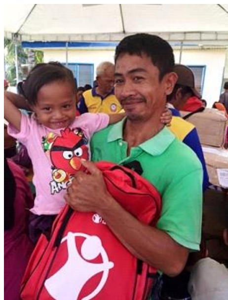
Mamasapano, Maguindanao (June 2015) – A man and his daughter receive a back-to-school kit.

Muslim Mindanao (ARMM), joined by the ARMM Humanitarian Emergency Action and Response Team, local government units and the inter-agency Communications Core Group, distributed 263 back-to-school kits to pupils of Lower Pidsandawan Elementary School in Mamasapano municipality. The provision of school supplies benefited 138 girls and 125 boys from kindergarten to the sixth grade. Each kit contains ten notebooks, two pencils, an eraser, a box of crayons, a pencil case, a water bottle, a lunch container, a soap bar, a toothbrush with toothpaste, a nail clipper and a pair of boots.